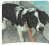
Petey Adult Allegan